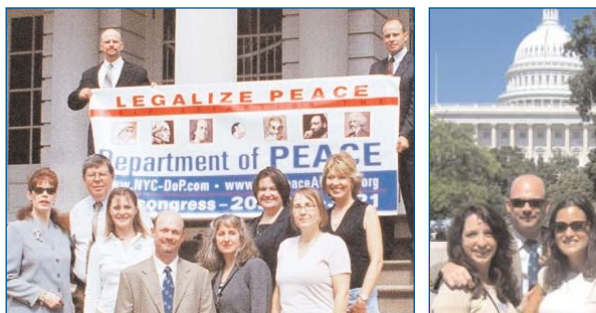
NYDOP members outside City Hall in NYC and outside the Capitol in Washington, D.C..

New Yorkers for a Department of Peace (NYDOP) is a local citizen organization, and part of a national effort initiated by The Peace Alliance, to establish a cabinet-level, Department of Peace within the U.S. Government. NYDOP empowers ordinary citizens to have a greater impact on the political process by providing education events and trainings. Using public outreach and the media, NYDOP works to raise public awareness about the power and effectiveness of nonviolent alternatives.